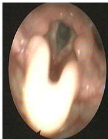
Figure (5): Laryngomalacia