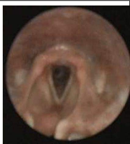
Figure (4): Subglottic stenosis