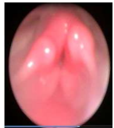
Figure (6): First degree laryngomalacia